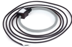
E683x Series Rope CT (sold separately)

The E5xxxA Series DIN Rail Meter combines exceptional metering performance with a built-in integrator and power supply to deliver a cost-effective, easily installed solution for power monitoring applications. Multiple communication protocol options offer added flexibility for easy system integration.